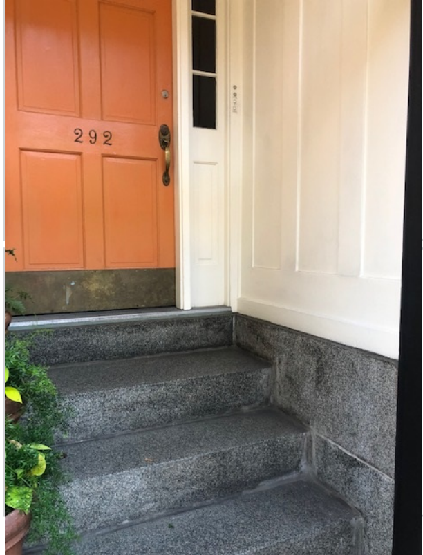
292 SHAWMUT AVE.