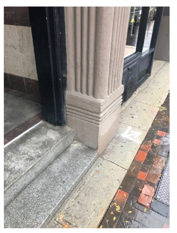
EXISTING GRANITE STEP / RISERS TO REMAIN)