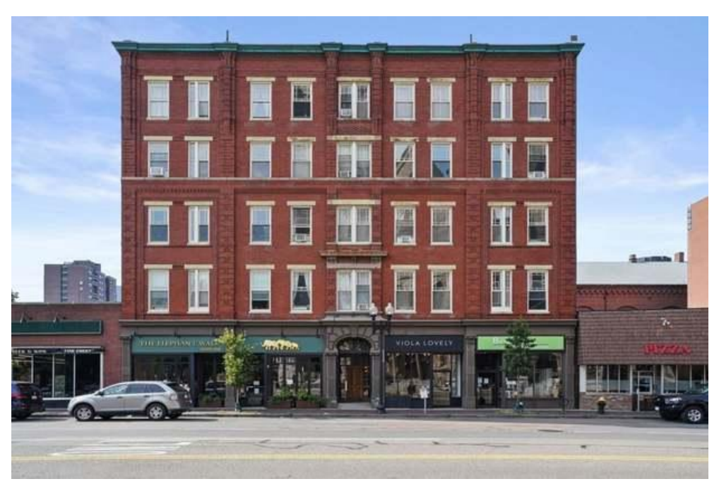
WASHINGTON STREET FACADE SHOWING MAIN RESIDENTIAL ENTRANCE

EXISTING CONDITION - 1411 WASHINGTON STREET BOSTON MA 02118