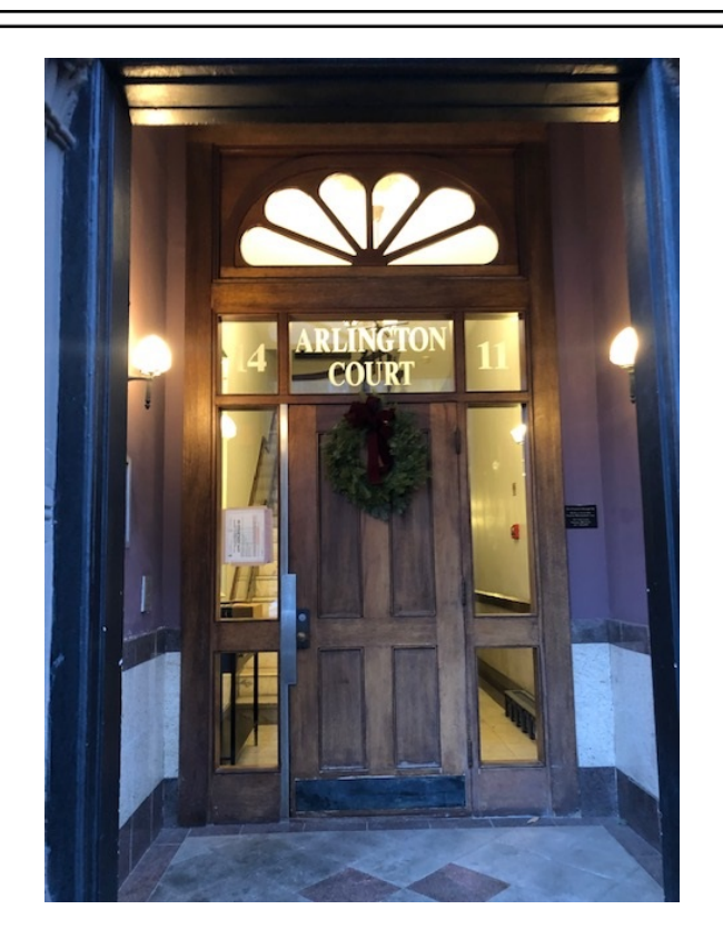
MAIN EXISTING DOOR W/ WAINSCOT TILE (NON-HISTORIC)