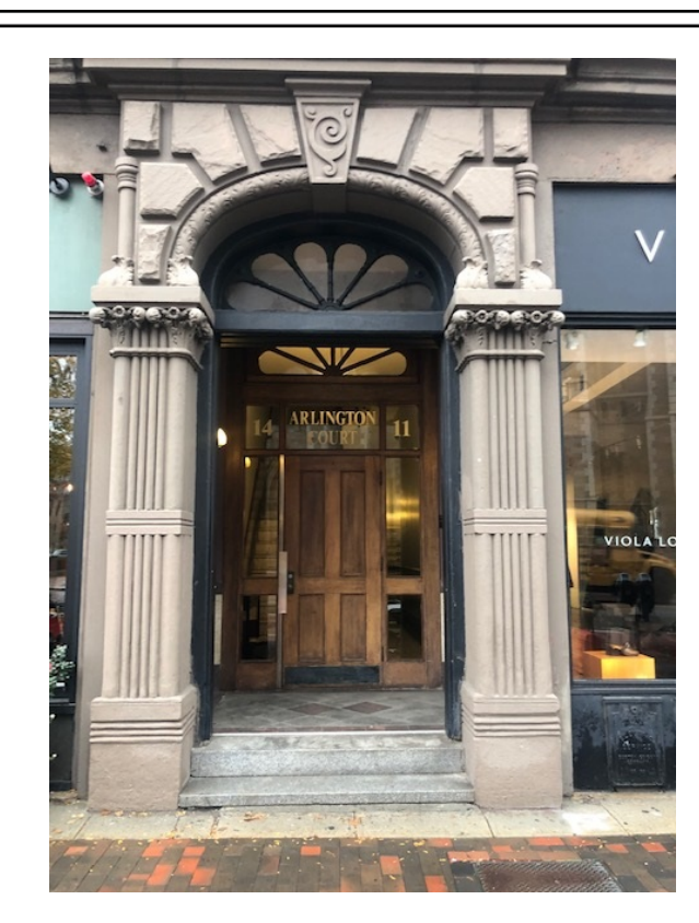
ENTRY PORTAL (HISTORIC)