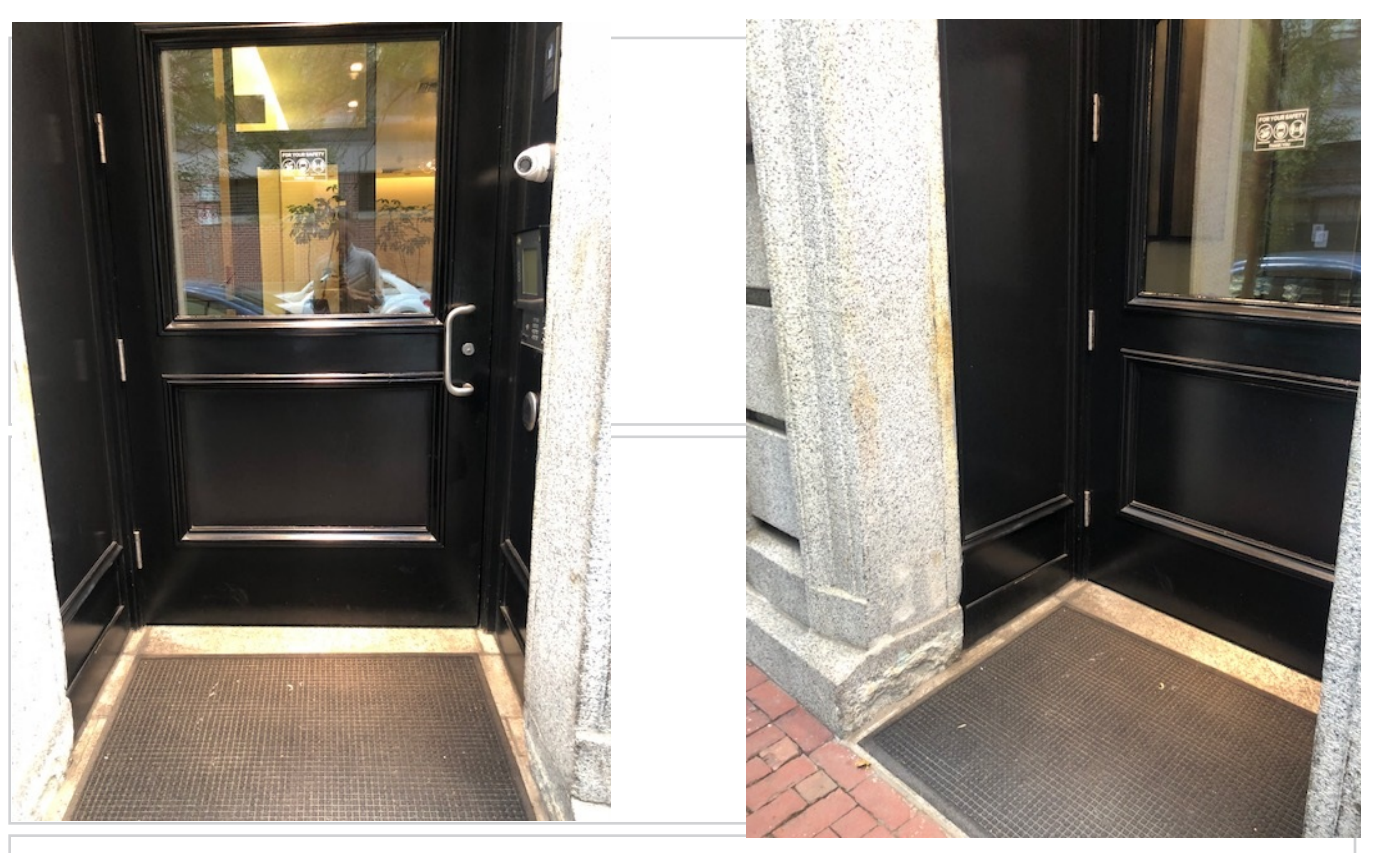
PENNY SAVINGS CONDOS 30 UNION PARK STREET