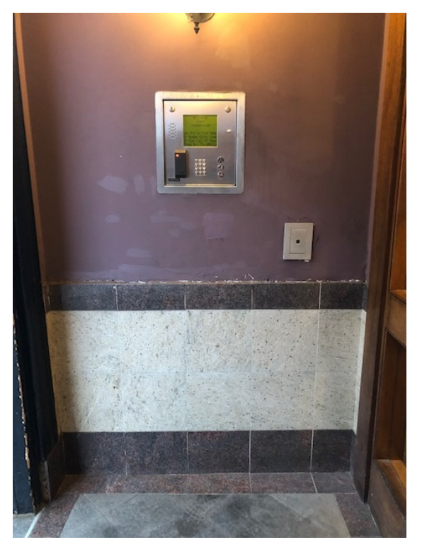
EXISTING CIRCA 1995 TILE TO BE REMOVED (WEST WALL)