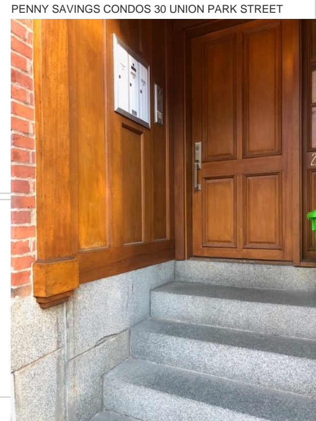
296 SHAWMUT AVE.