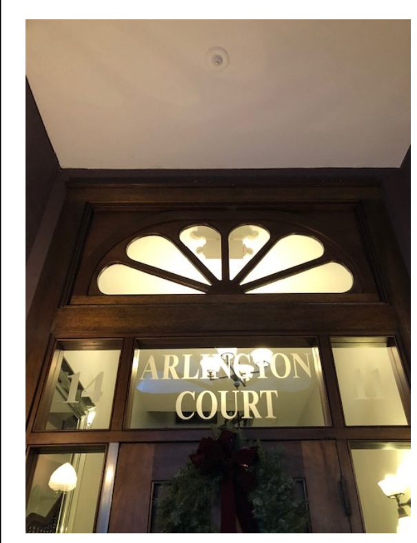
MAIN EXISTING DOOR - DOOR FRAME TO BE PAINTED